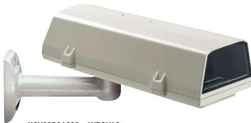
HOV32D0A000 + WBOVA2

These accessories are supplied as a simple plug-in kit for easy installation or factory-installed.