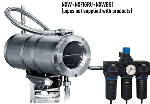
NXW+NXFIGRU+NXWBS1 (pipes not supplied with products)

Two 1/2" gas connectors allow for the cooling liquid inflow/outflow. The NXW is equipped with an ONXAB1 flange designed to create an air barrier in front of the glass. This prevents the formation of dust deposits and attenuates the heat of the glass itself. With the supplied air barrier, the NXFIGRU filter group is recommended, which purifies the air drawn from a compressor. The solid construction of this housing makes it suitable for heavy duty applications, such as the surveillance of ovens, foundries, and other high temperature environments.