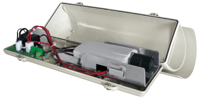
VERSO POLAR + CAMERA

VERSO POLAR offers the possibility of various mounting options.