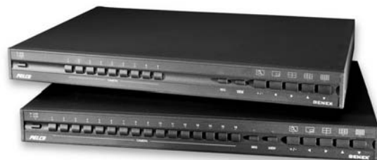
MX4009CD (TOP), MX4016CD (BOTTOM)

The Genex ® high performance, color duplex multiplexer utilizes the latest in digital video processing technology, providing high-quality recordings and outstanding multi-camera displays.